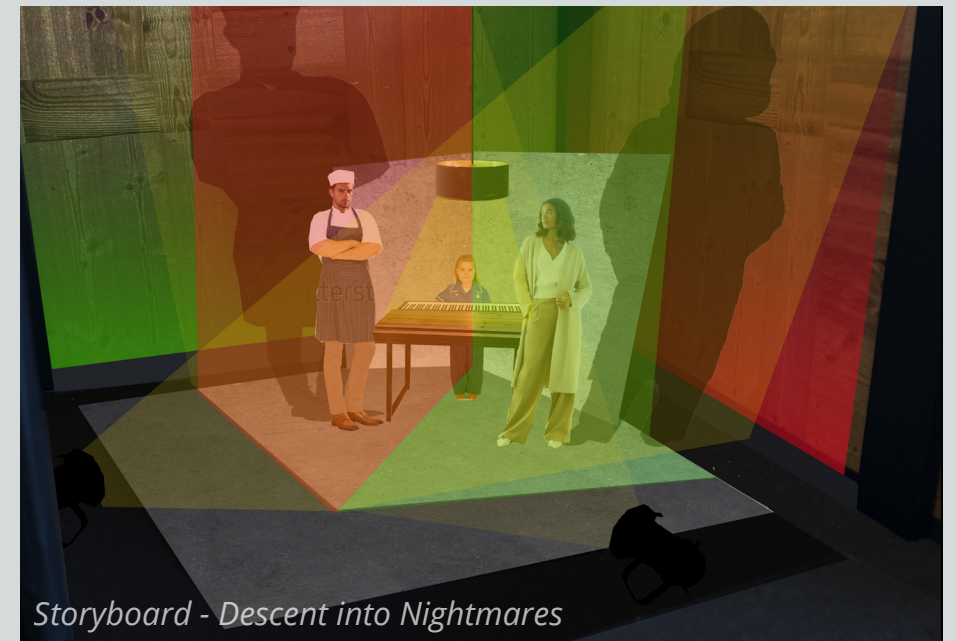
Storyboard - Descent into Nightmares

"I was convinced that in order to be a writer I'd simply have to travel to this city - the one inside of me - and write down what I discovered there.