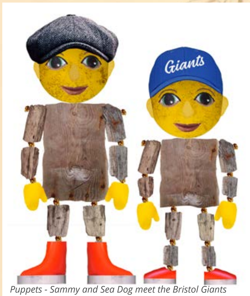
Puppets - Sammy and Sea Dog meet the Bristol Giants