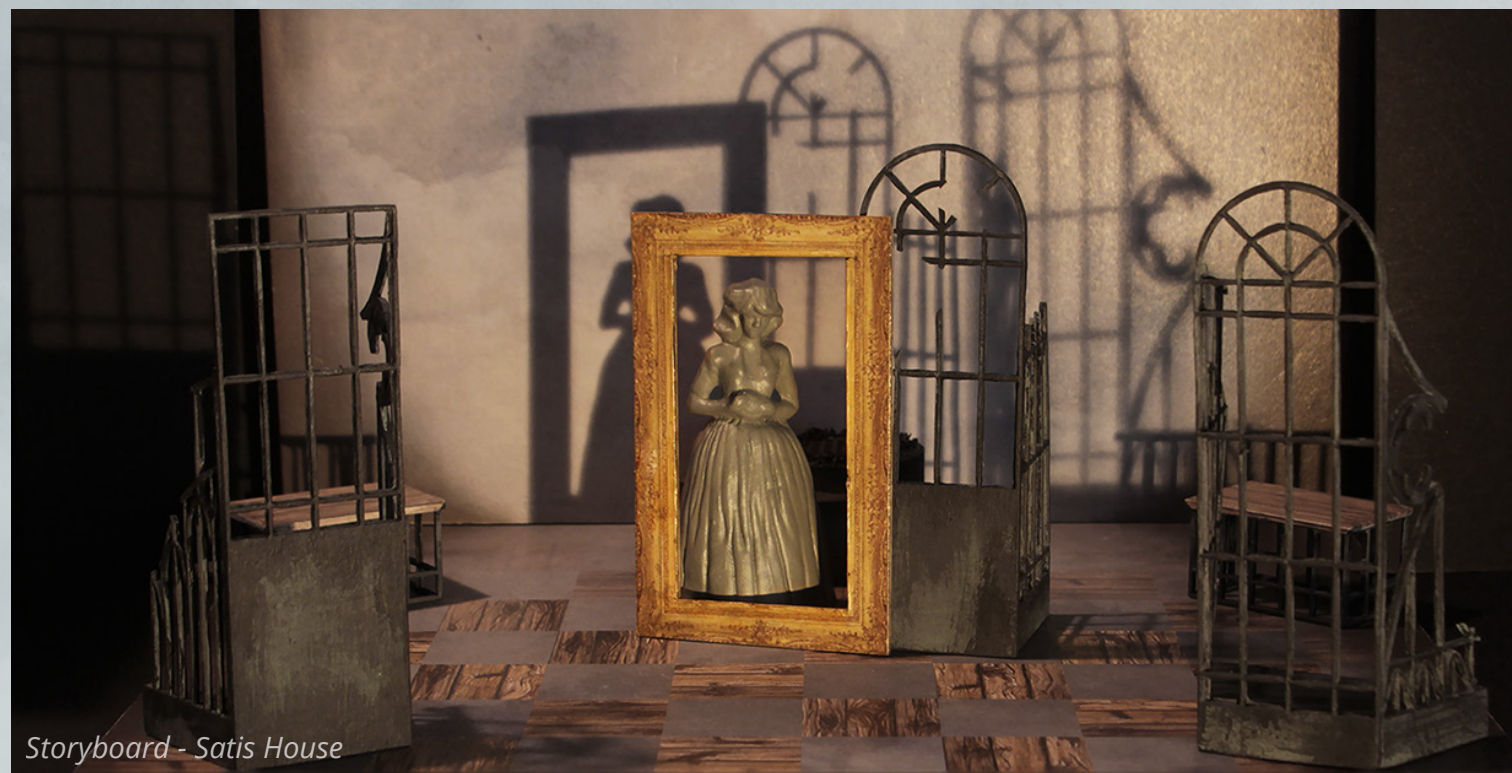
Storyboard - Satis House