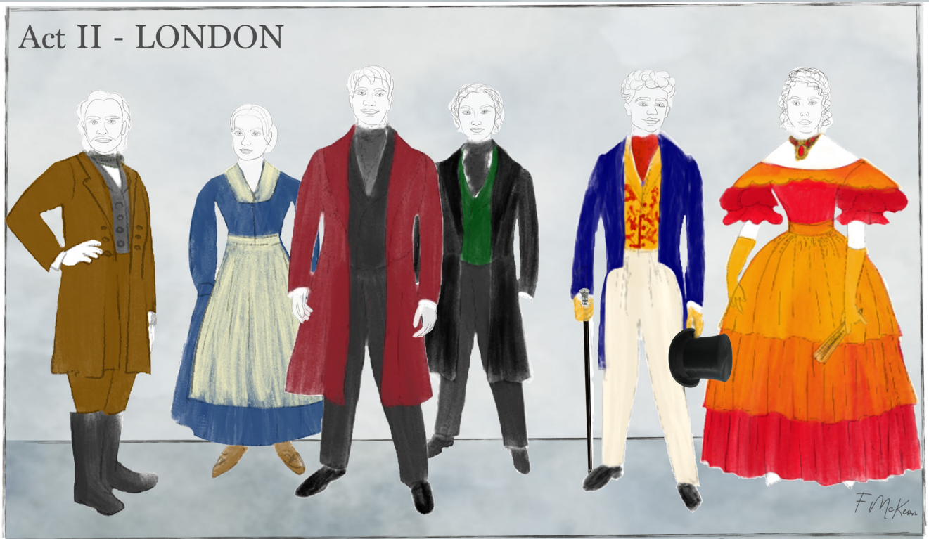
Costume Drawings - Londoners