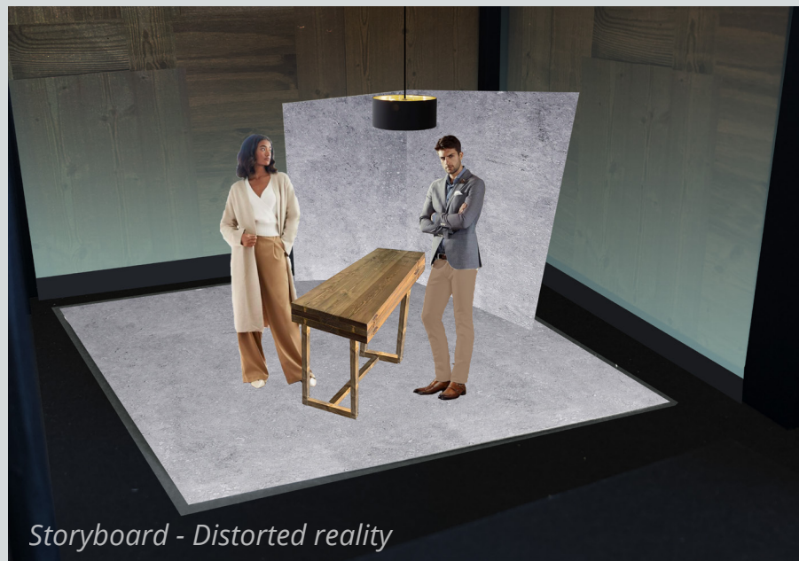
Storyboard - Distorted reality