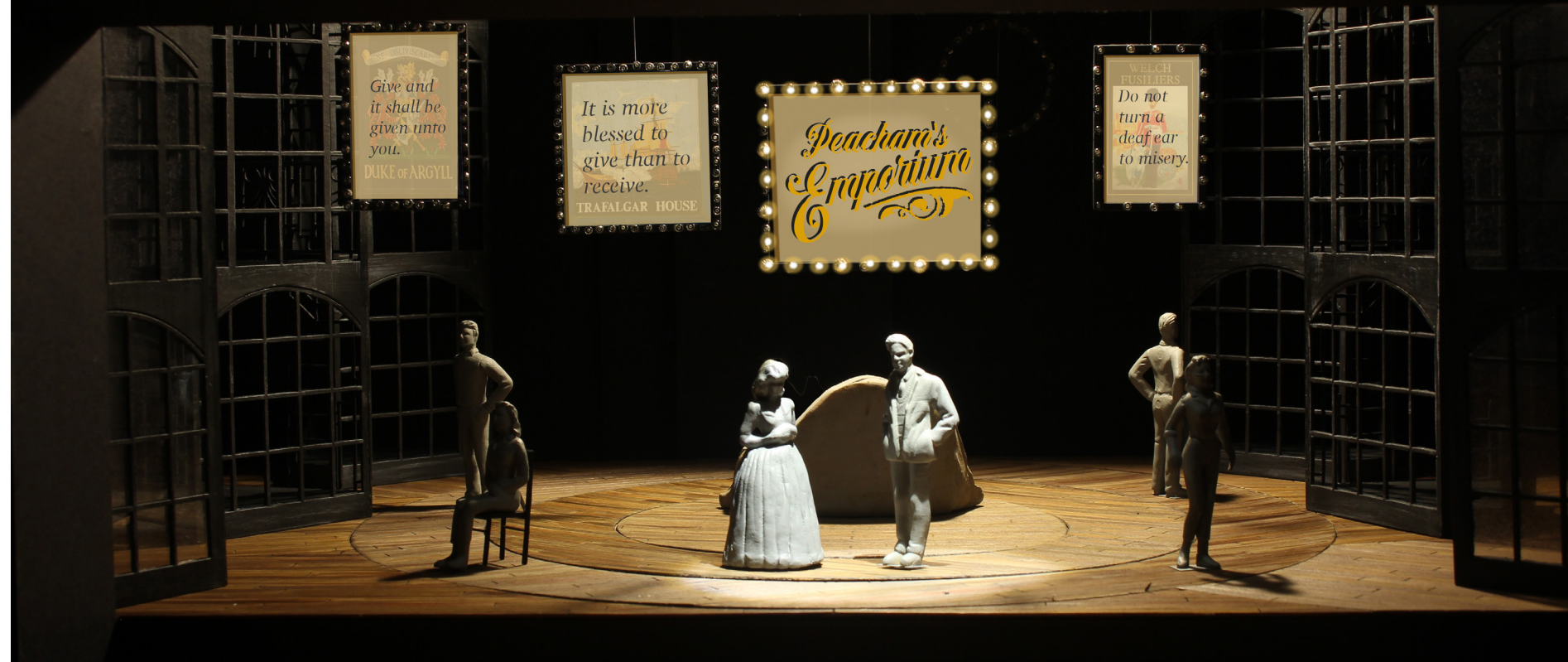
Design Storyboard - Peachum's Emporium for the Less Deserving

Brecht and Weill's work and social commentary is still relevant to today's society. We used the three acts to move the story from its setting to current society to demonstrate this.