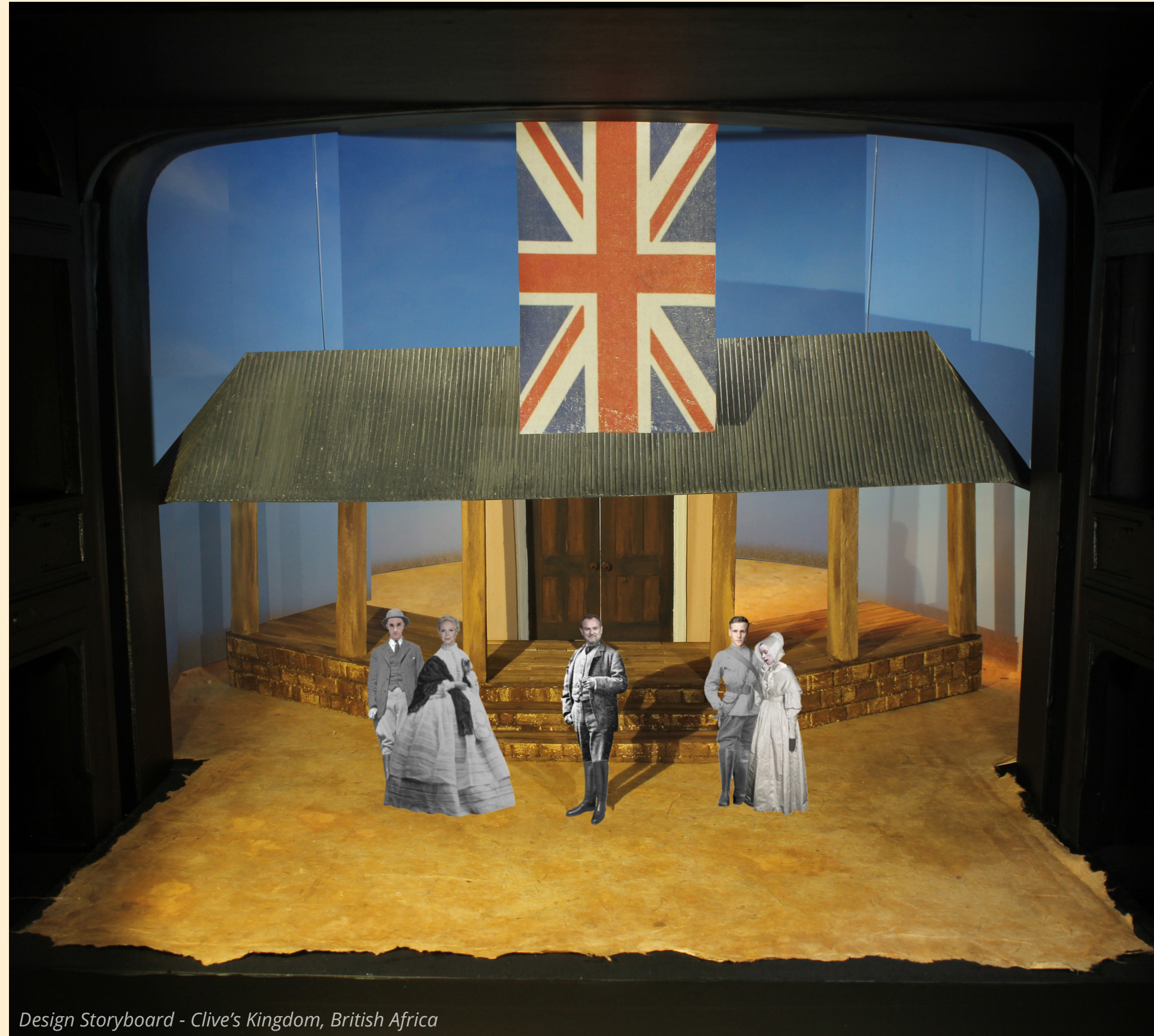
Design Storyboard - Clive's Kingdom, British Africa

The second act follows the same family 25 years later but 100 years in the future in London. Exploring the changes and opportunities for all people.