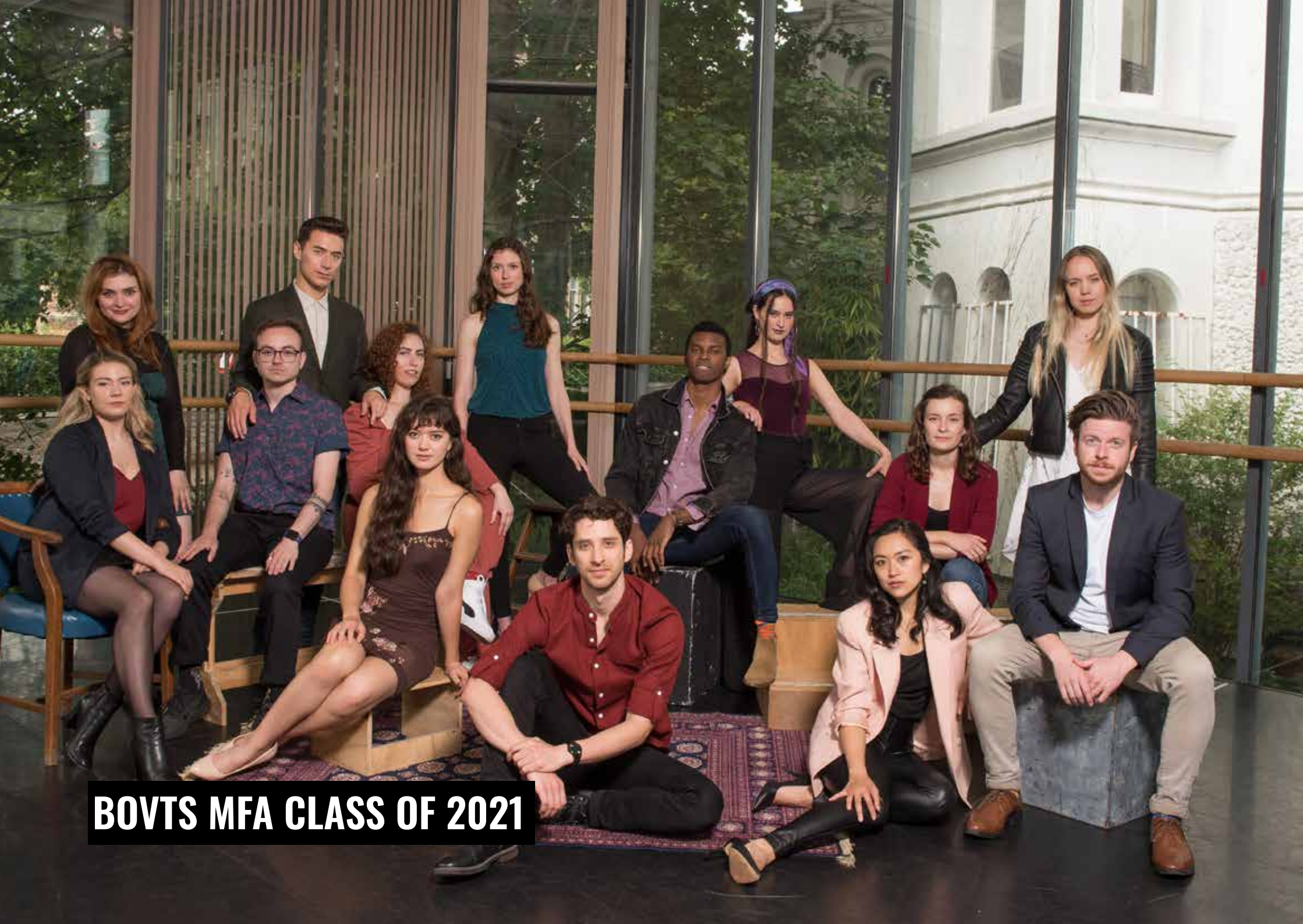
BOVTS MFA CLASS OF 2021